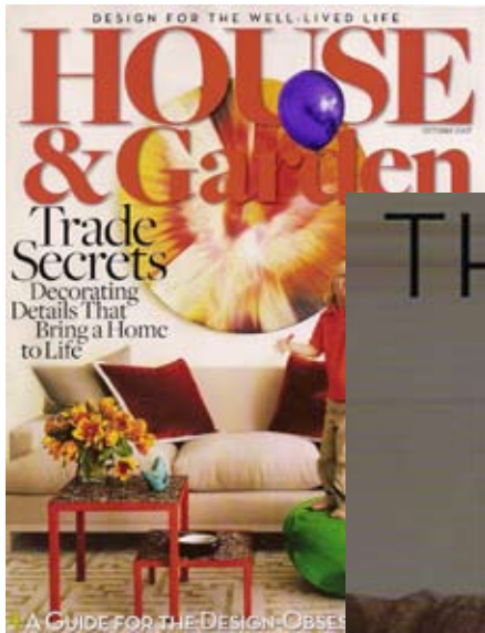
HOUSE & GARDEN 2007