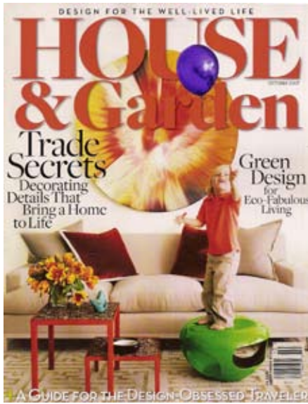
HOUSE & GARDEN 2007